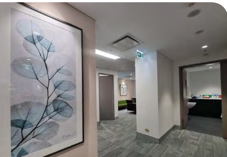
New San Breast Care rooms

San Breast Care was entirely funded by grateful and caring donors like you, we are so proud and grateful for your support to make this is possible at the San.